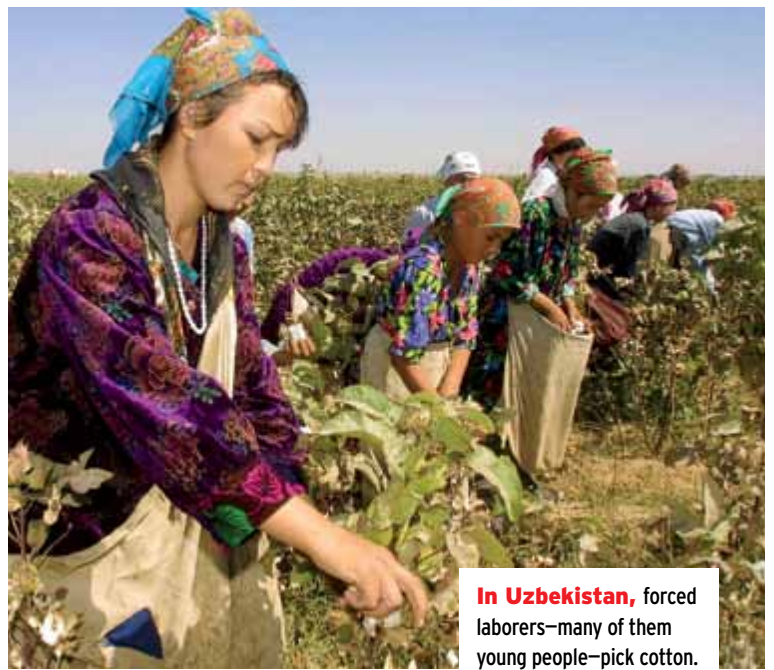
In Uzbekistan, forced laborers—many of them young people—pick cotton.

His plight is shared by millions of people in the world today. More than 27 million live in “modern slavery,” according to the U.S. Department of State. That includes 60,000 in the U.S., according to the Global Slavery Index, which tracks the phenomenon around the globe.