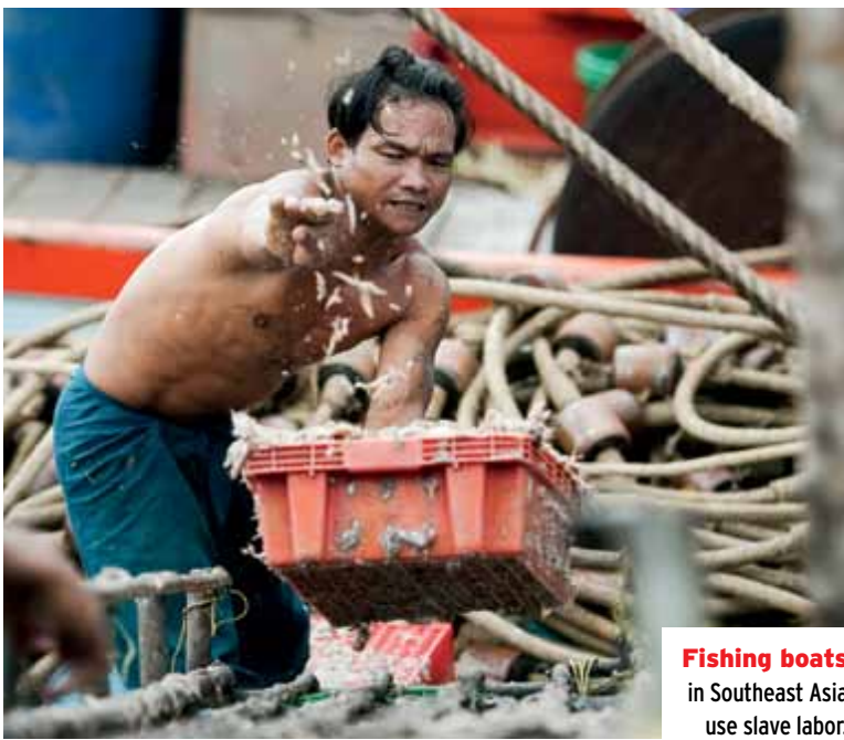
Fishing boats in Southeast Asia use slave labor.